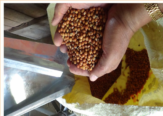
Cleaned /graded grain (Split Red Gram)