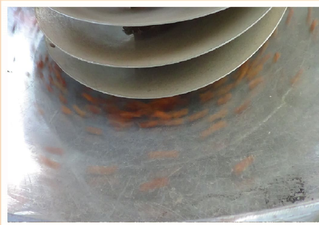
Movement of grain in Spiral