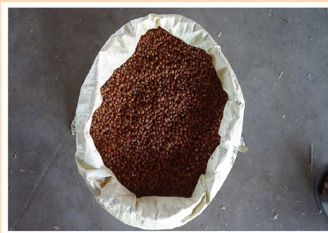
Sample to be graded (Split Red Gram)

Place of Test :- BAU Farm, Kanke Road, Ranchi