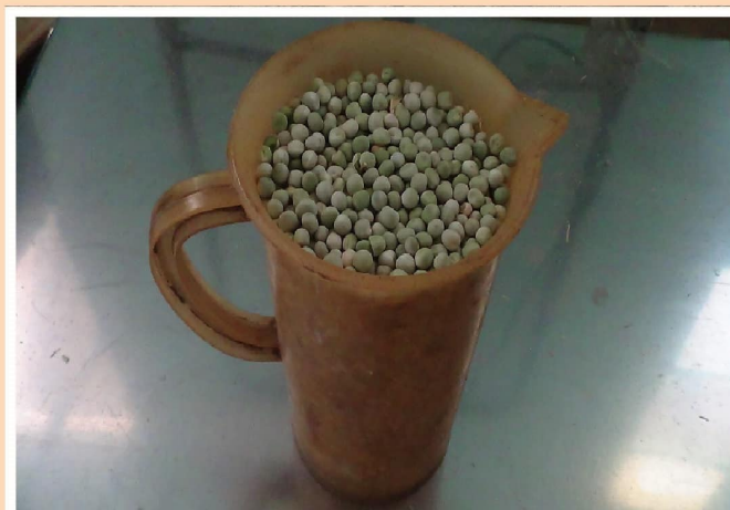
Bulk Density g/cc