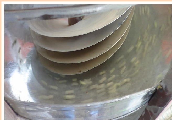
Movement of grain in Spiral