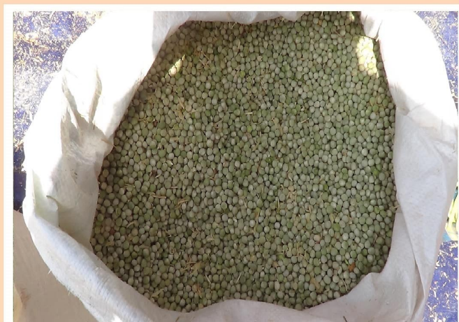
Sample to be graded(Green pea)

Place of Test :- BAU Farm, Kanke Road, Ranchi