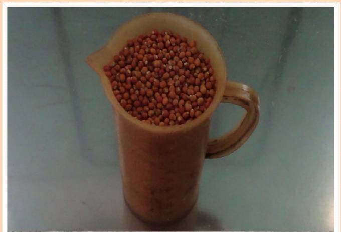
Bulk Density g/cc