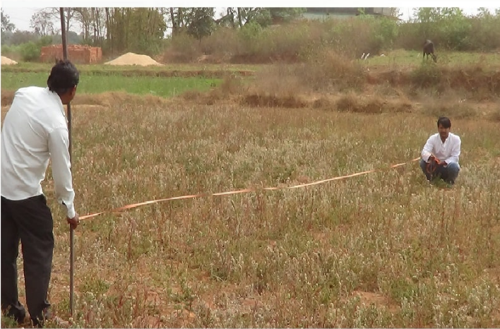
Demarcation For Field Speed