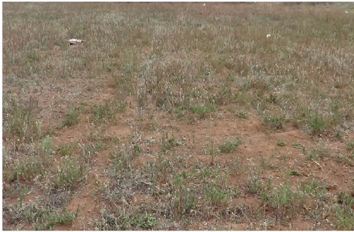
Paddy Harvested Field For Test

Place of Test:- Doka Toli, Piska Nagri, Ranchi