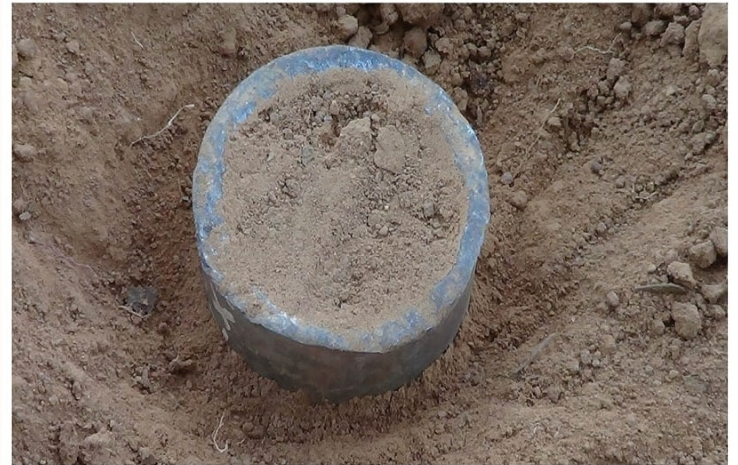
Soil Bulk Density Measurement (g/cc)