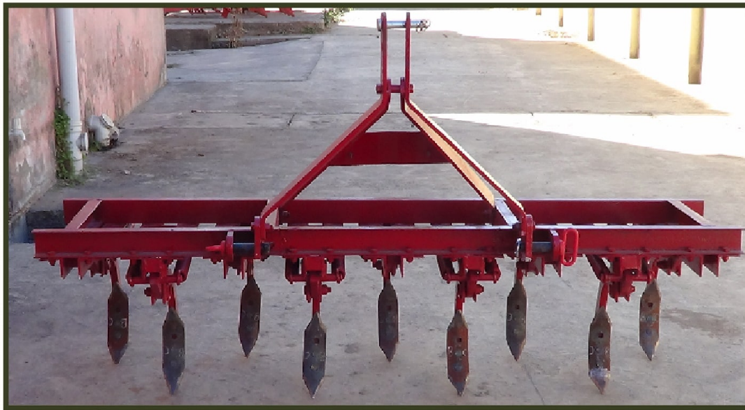
SPRING LOADED NINE TINE CULTIVATOR (Tractor Drawn)

VALIDITY - THREE YEARS UP TO 28 th February, 2020