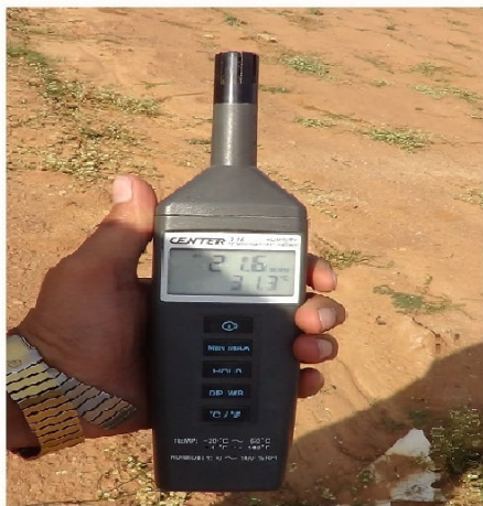
At. Condition Measurement

Place of Test:- Doka Toli, Piska Nagri, Ranchi