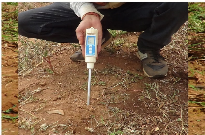
Soil Moisture measurement