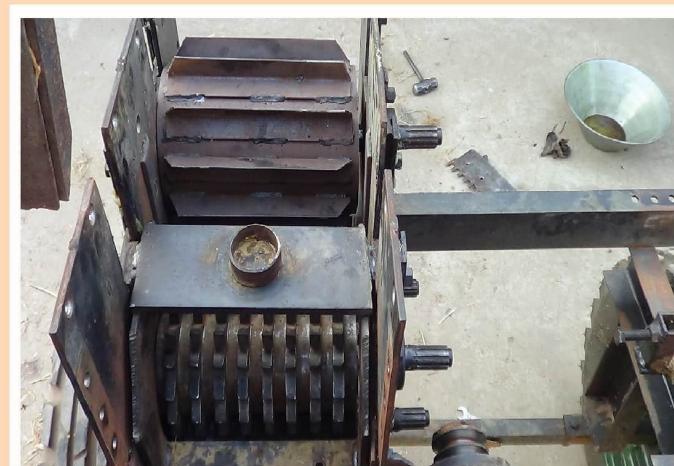
Feed and Pressing Roller

JHARKHAND AGRICULTURE MACHINERY TESTING & TRAINING CENTRE ETC CAMPUS, HEHAL, RANCHI - 834005 (JHARKHAND)