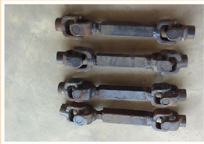
Feed Roller and Conveyer Drive Shaft