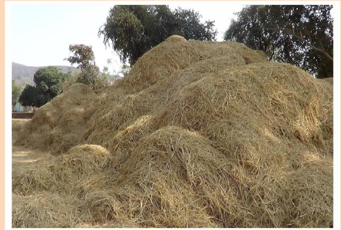
Raw Fodder for Chaff