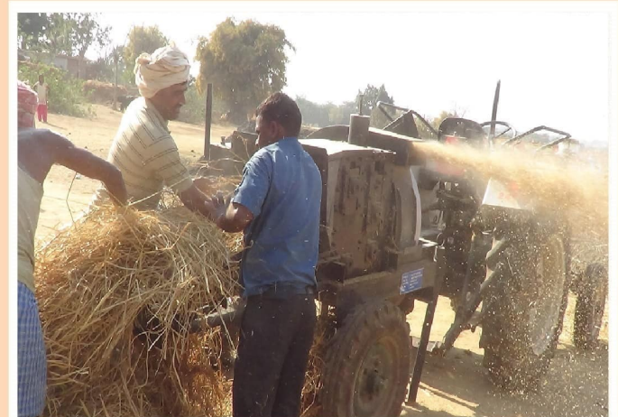
Machine in Operation

JHARKHAND AGRICULTURE MACHINERY TESTING & TRAINING CENTRE ETC CAMPUS, HEHAL, RANCHI - 834005 (JHARKHAND)