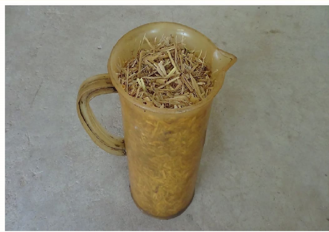
Chaff Density Measurement