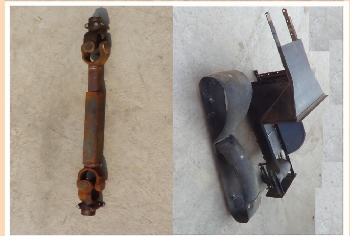
p.t.o. Power Shaft Feeding conveyer with Flap Belt