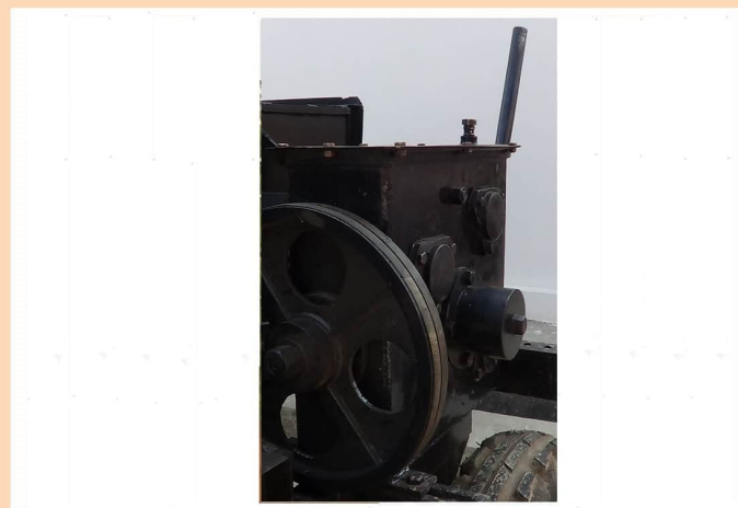
Gear Box with Breather/Drain Plug