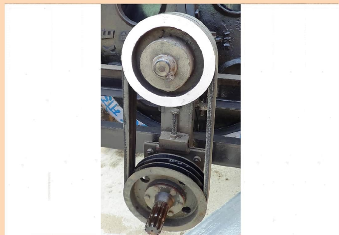
Power Supply to Cutter