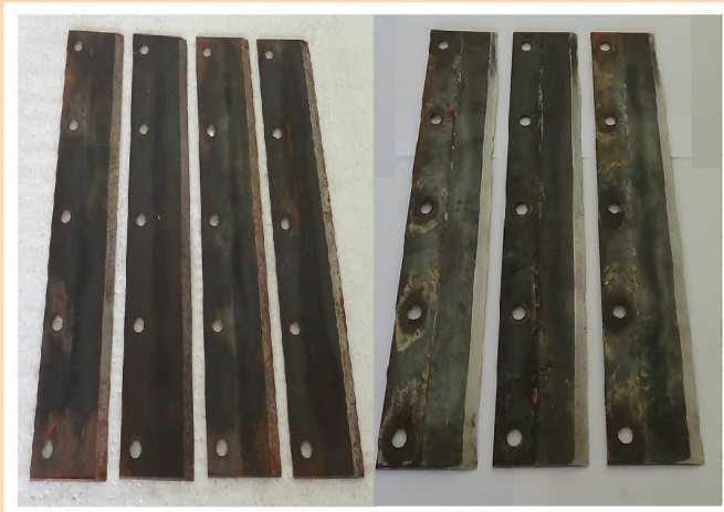
New Cutting Blade and Old Blade

Place of Test - Village - Karam Tad, Block - Sonahatu, Ranchi