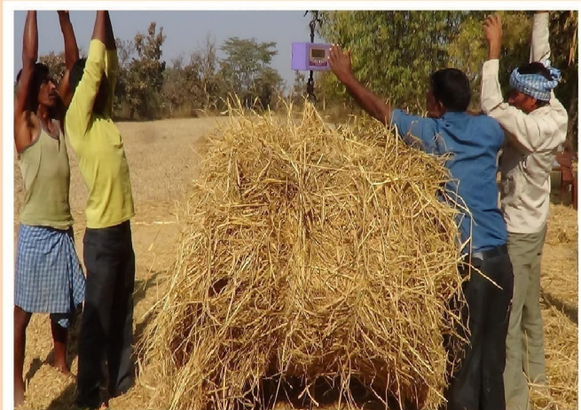
Test Sample Weighing